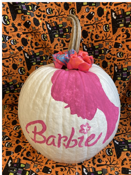
Pop culture pumpkin

Each month he moves the cameras to new locations around Eastman Nature Center. These Browning Dark Ops are high quality cameras that take pictures if something moves in front of the camera. It could be day, night, wildlife, kids at camp or a blade of grass blowing in the wind. Sometimes thousands of pictures must be reviewed but Dave enjoys the process, "I've always enjoyed photography but my enjoyment really ramped up during the pandemic". The camera project has been so successful that NRM has invested in adding additional camera.