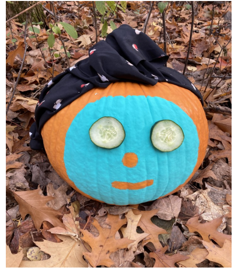
Pumpkin spa day

good time for families. Those who poured cider, greeted guests at the registrations table, wiped down tables, stacked haybales, called bingo numbers and staged green screen photos also made this annual event memorable.