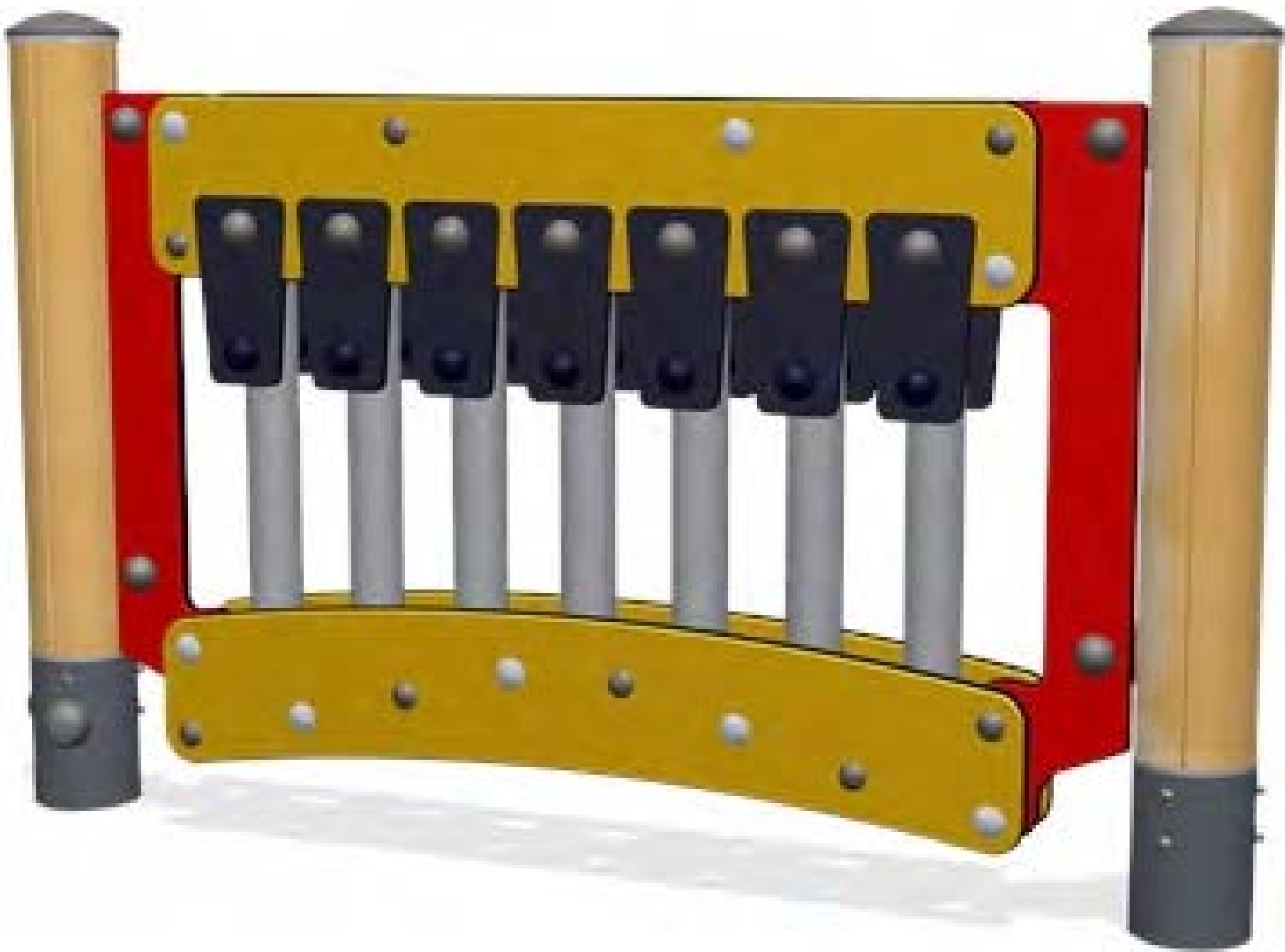
SENSORY PLAY: MUSIC MAKER