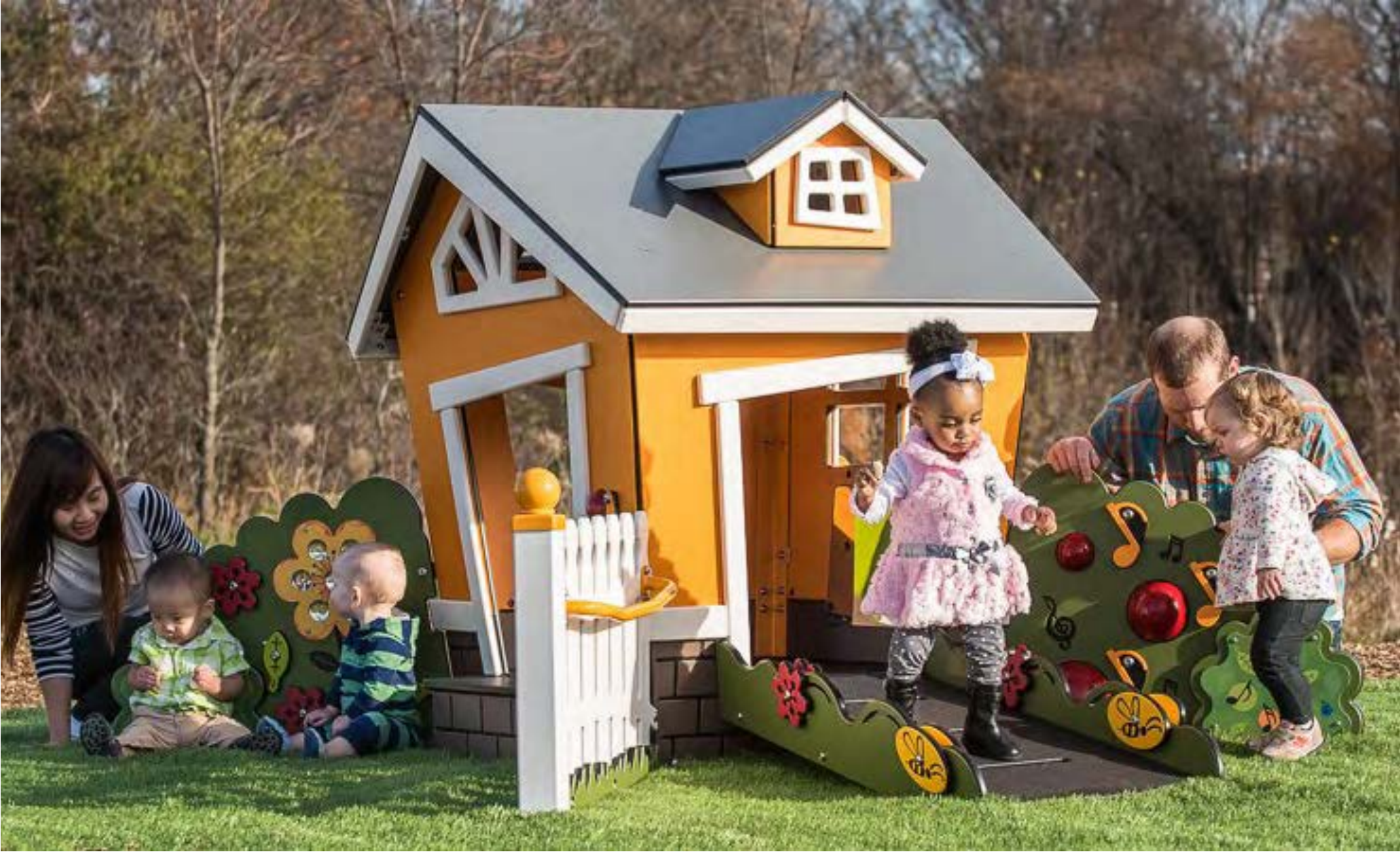
SENSORY PLAY: SMART PLAY NOOK AND LOFT