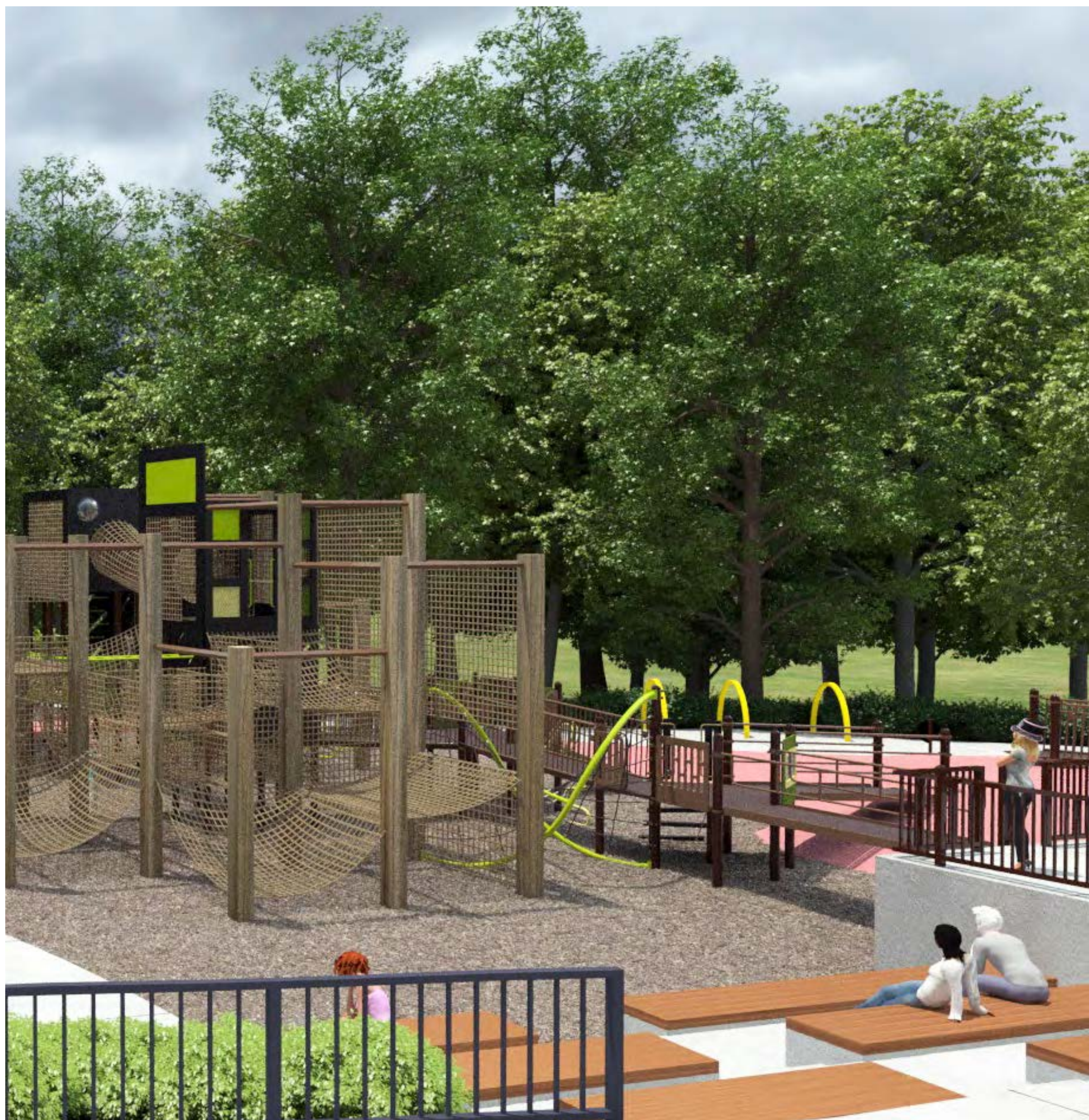
C: SEATING TERRACE