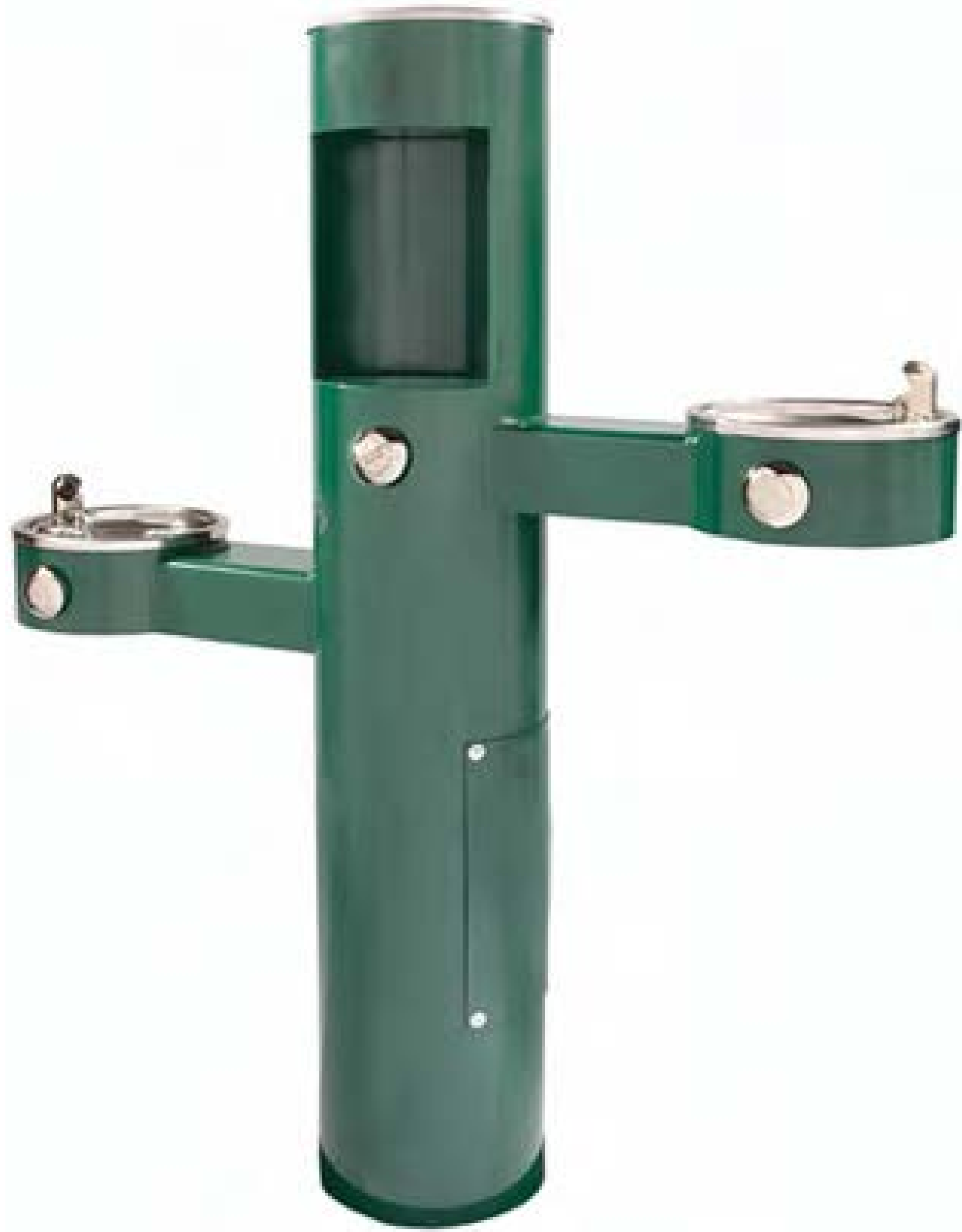
DRINKING FOUNTAIN WITH JUG AND BOTTLE FILLER