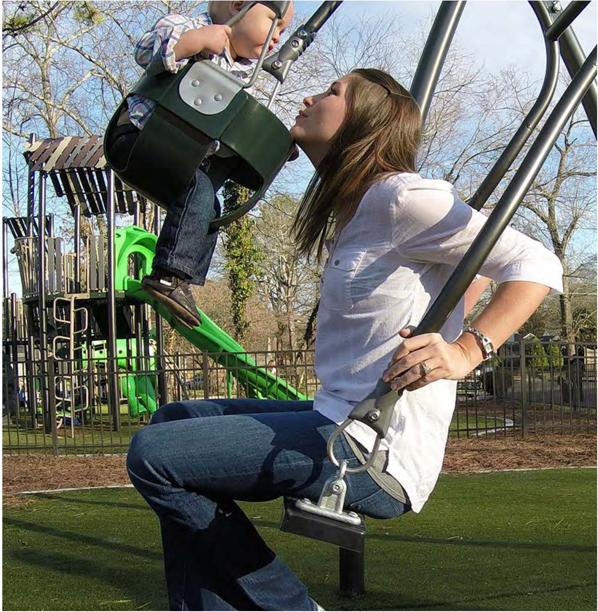
FACE TO FACE SWING