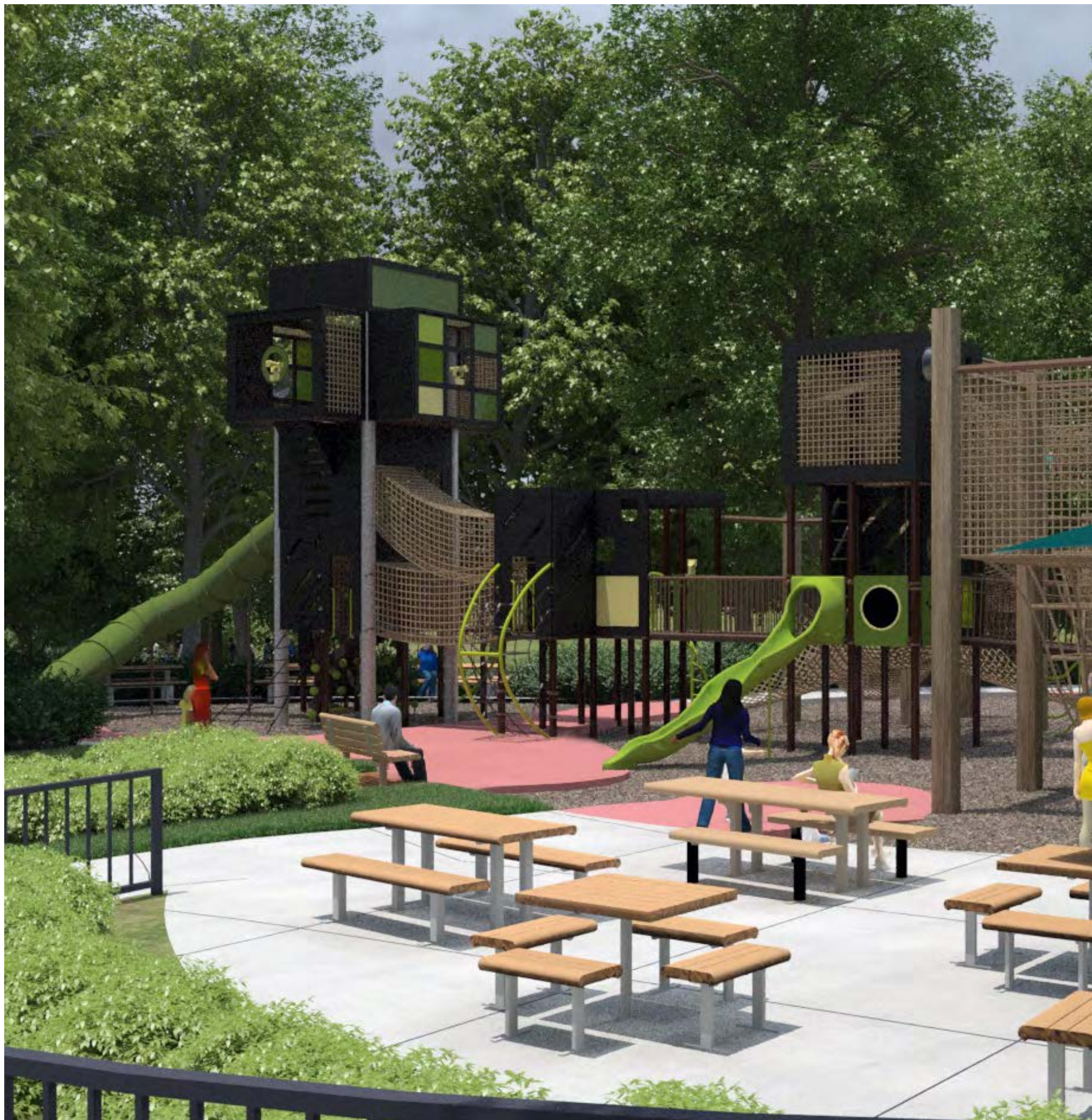
B: EXPANDED PATIO SEATING