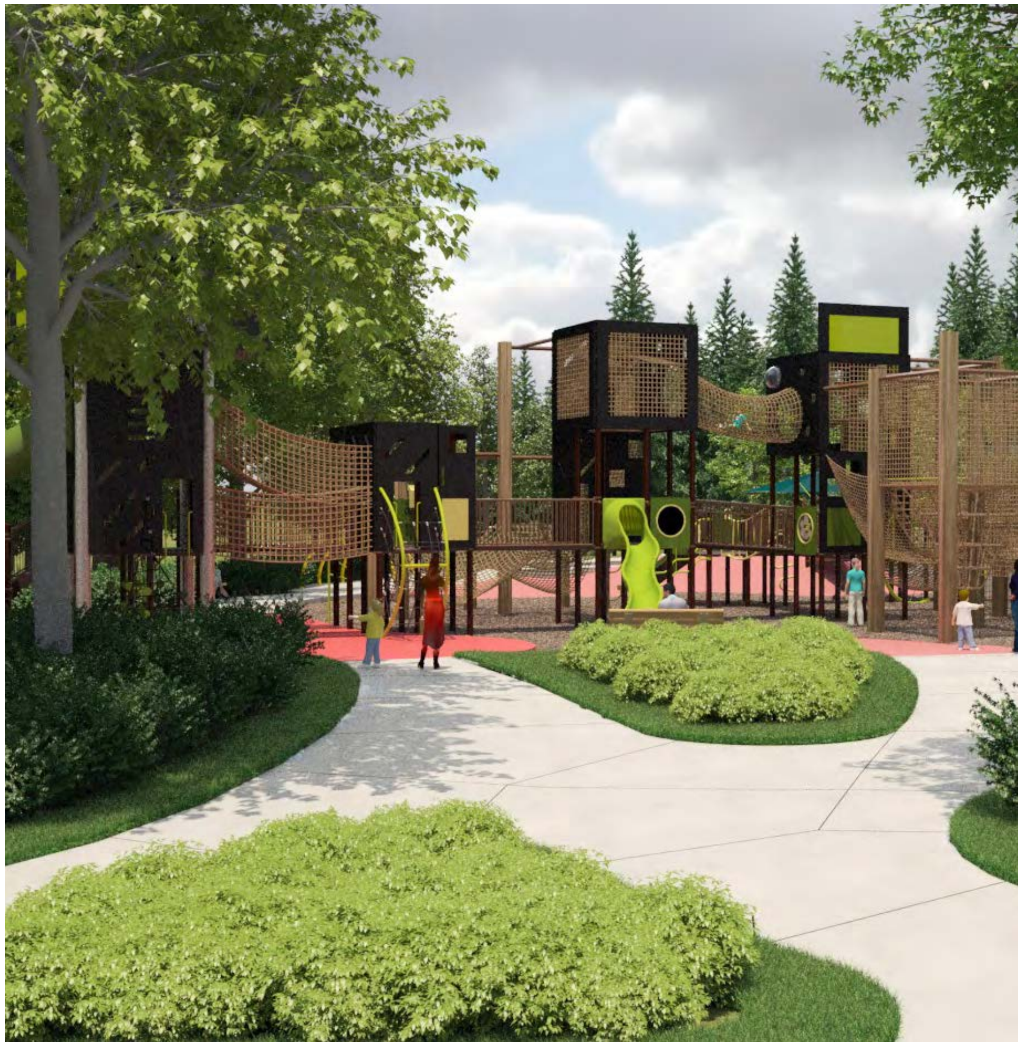
A: PLAY AREA ENTRANCE