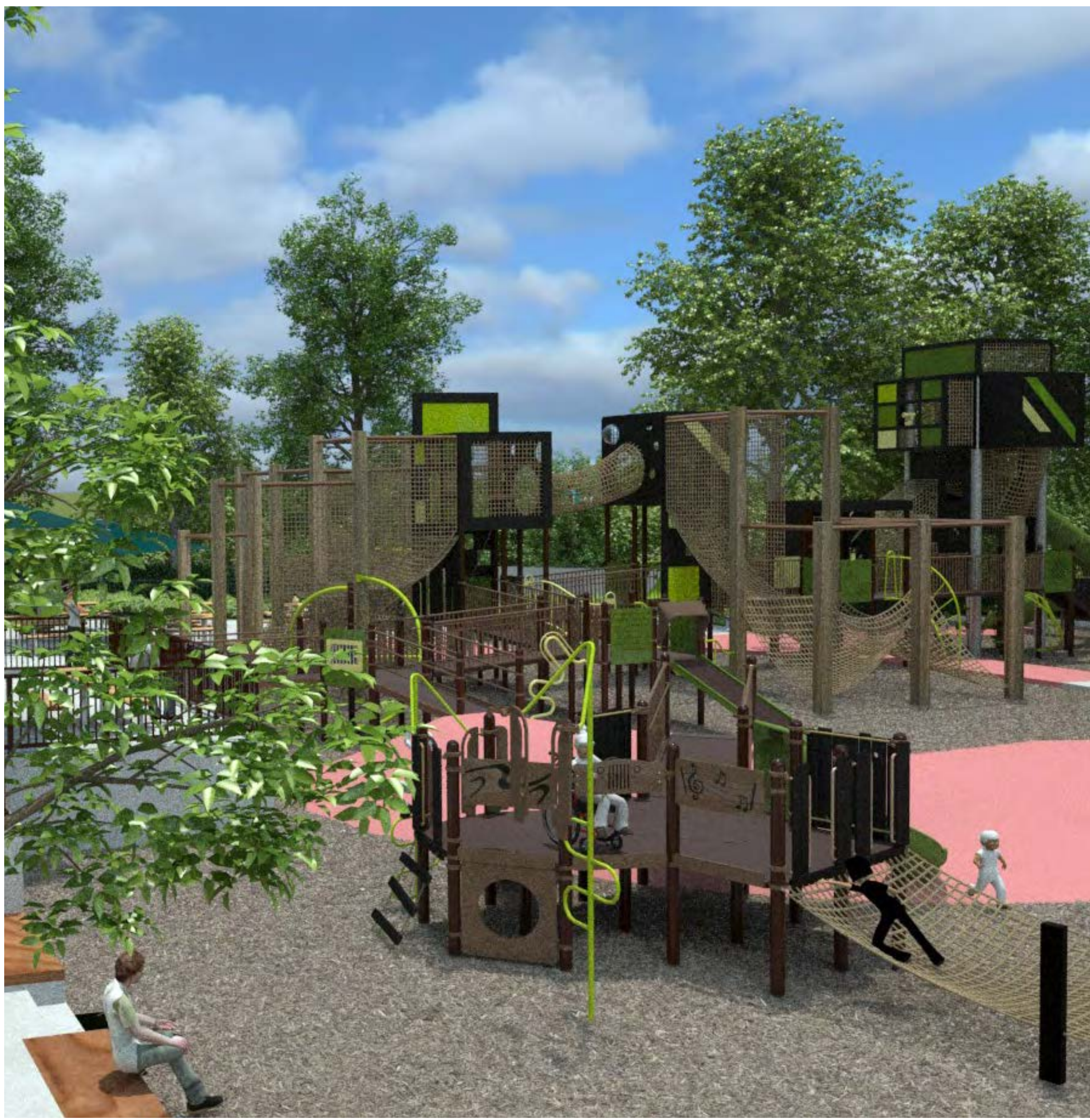
D: PRE-K PLAYGROUND