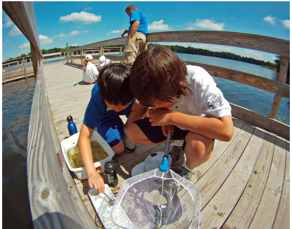
Summer campers get outdoors and gain an appreciation for nature while making new friends and memories. Volunteers help education staff make this possible.

text "trail" to 20222 to donate $10 and help enhance the trails