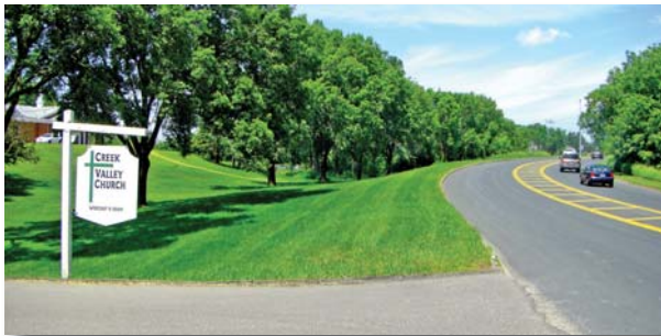
Route 5D is proposed within Tracy Avenue right-of-way, adjacent to the Creek Valley Church.

Route 5D starts at the northeast corner of the high school playfields, heads northeast to the south side of Highway 62 and then heads east to Tracy Avenue. A boardwalk is proposed to cross the creek and associated wetland areas. At Tracy Avenue the route heads south and parallels the west side of Tracy Avenue. An easement from Creek Valley Baptist Church may be required to minimize wetland impacts and minimize steepness of the trail. Route 5D ends at Valley View Road.