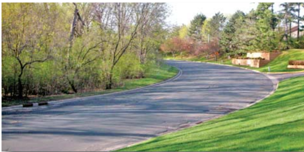
The above photos show Lincoln Drive facing south. Route 1 is proposed on the east side of the street.